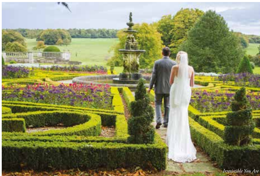
Irresistible You Are